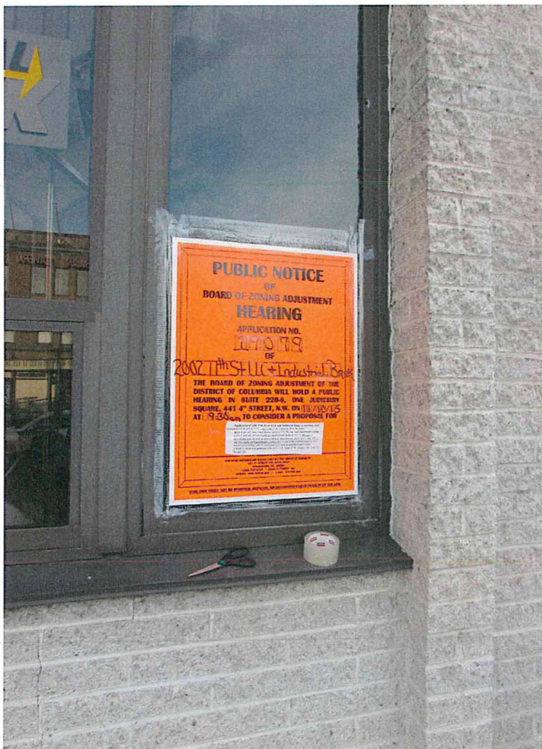
Photo 2 11th Street NW Frontage