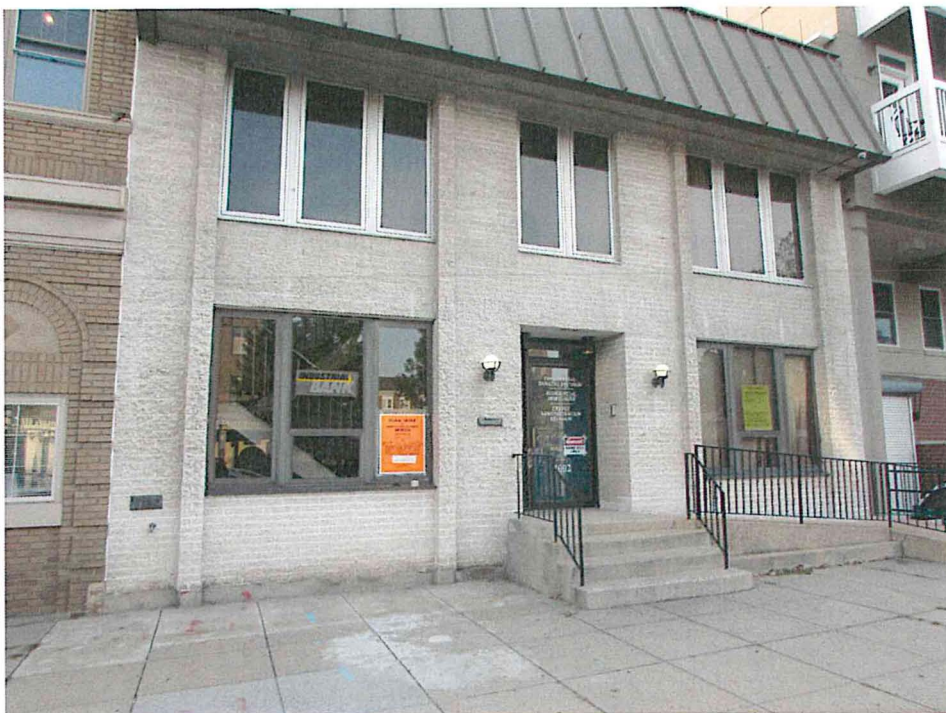
Photo 1 11th Street NW Frontage