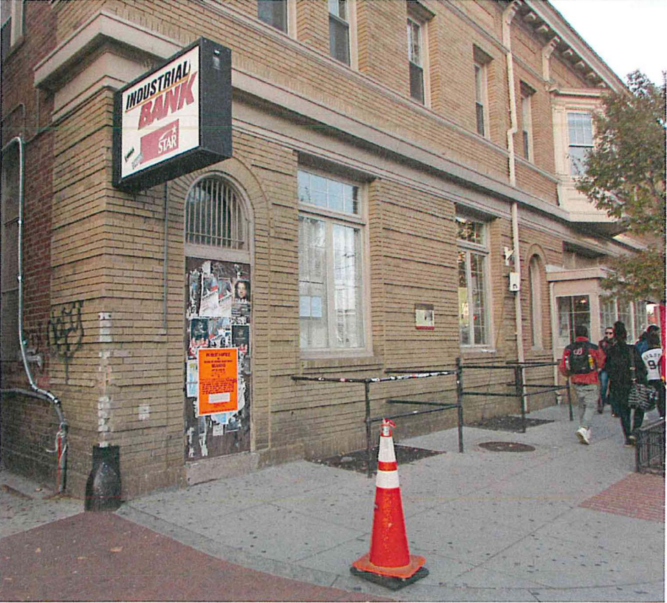
Photo 4 U Street NW Frontage