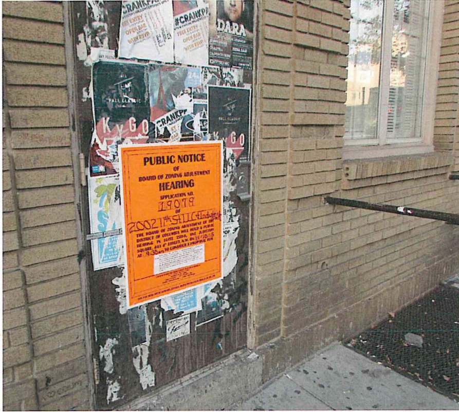
Photo 5 U Street NW Frontage